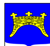
County of Split and Dalmatia-SDC (HR) www.dalmacija.hr