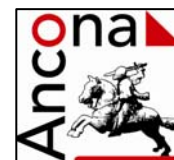
Municipality of Ancona Lead partner (IT) www.comune.ancona.it

-Fundación Comunidad Valenciana-Región Europea: is a non profit organization under the protection of the Valencian Regional Government. Its aim is to encourage the participation of all the sectors of the Valencian Region in the European Union's policies and to spread a better knowledge of these policies in the Valencian society.