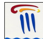
Forum of Adriatic and Ionian Cities and Towns FAICT (IT) www.faic1999.net