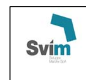
Sviluppo Marche-SVIM (IT) www.svimspa.it